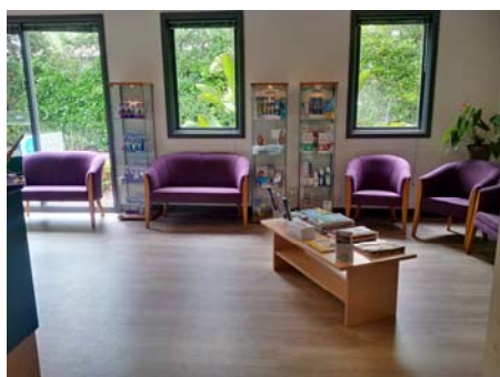
Waiting Room After